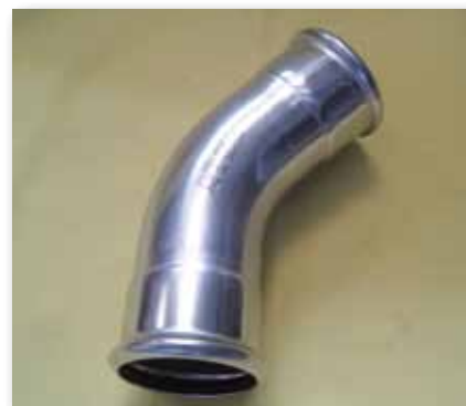
DP20.015 PRES CURVA 45 FF DM 15 AISI 316 181450