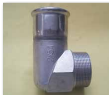
DP15.015102 PRES Gomito MISTO M1/2 PRES 15 AISI 316 197