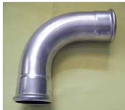
DP18.015 PRES CURVA 90 FF DM 15 AISI 316 181900