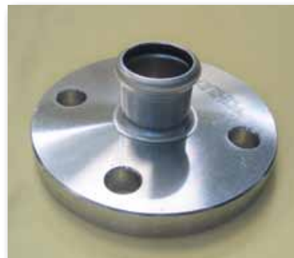
DP32.015015 PRES Flangia15 (PN16) Pres 15 AISI 316 193