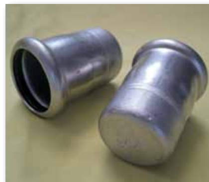
DP03.015 PRES Tappo Chiusura 15 AISI 316 183003