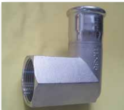
DP16.015102 PRES Gomito MISTO Fem1/2 PRES 15 AISI 316 198