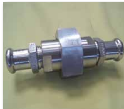
DP37.015 PRES Bocc sede piana Pinzare 15-15 AISI 316 184001