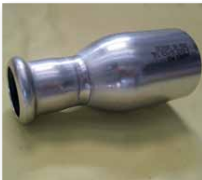
DP27.018015 PRES RIDUZIONE Tubo 18 Pres 15 AISI 316 191