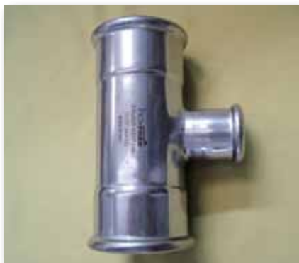
DP25.018015 PRES TEE Ridotto 18x15x18 AISI 316 192