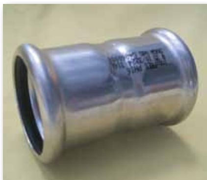
DP01.000 PRES MANICOTTO Battuta 15 AISI 316 183000