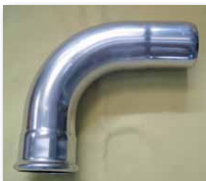
DP21.015 PRES CURVA 90 MF DM 15 AISI 316 181901