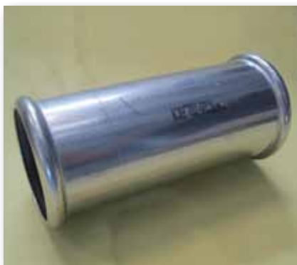
DP36.015 PRES MANICOTTO Passante 15 AISI 316 183001