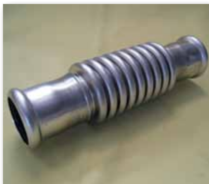
DP35.015 PRES Compensatori Dilatazione 15 AISI 316 199