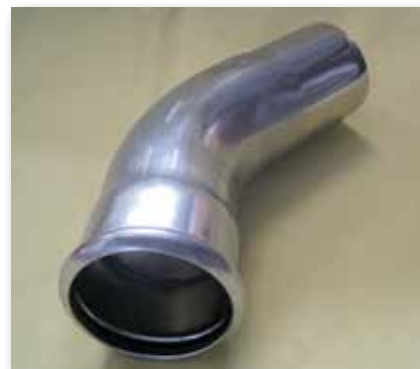
DP17.015 PRES CURVA 45 MF DM 15 AISI 316 181451