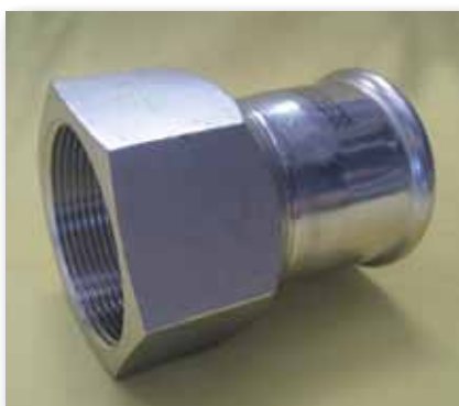
DP08.015102 PRES Manicotto Femm F1/2 PRES 15 AISI 316 190