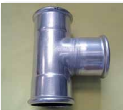
DP23.015 PRES TEE DM 15 AISI 316 182