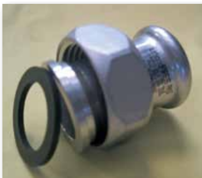
DP02.015102 PRES MANICO D FOLLE 1/2 PRES 15 AISI316 183002