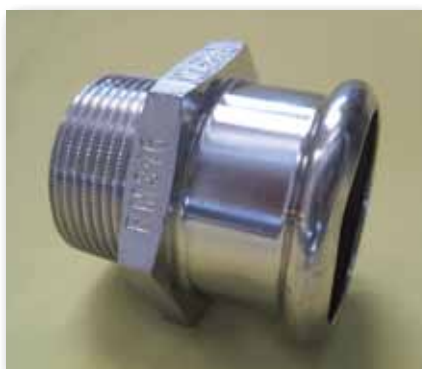
DP07.015102 PRES MANICOTTO Mas1/2 PRES 15 AISI 316 187