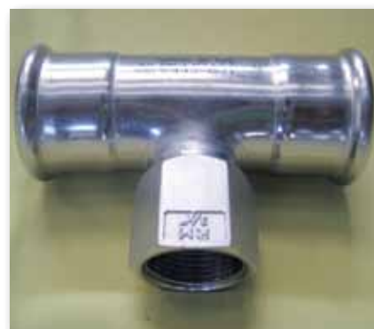
DP24.015102 PRES TEE 15 Derivaz Fem 1/2 AISI 316 189